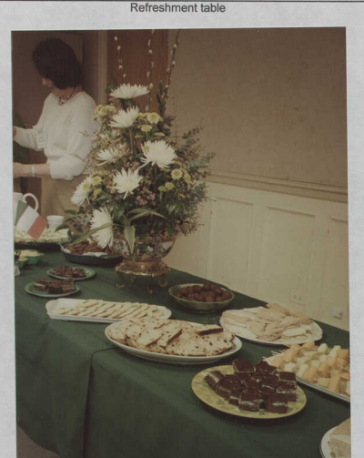
March 14, 2007 Rake & Hoe General Meeting Refreshment table