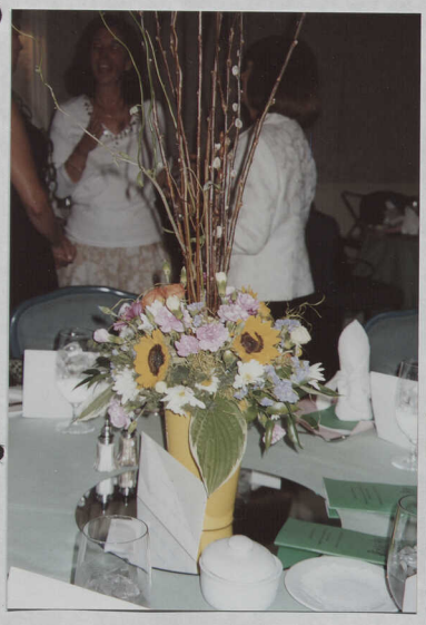
June 13, 2007 Rake & Hoe Awards luncheon at Echo Lake country Club- Sample of Centerpeices