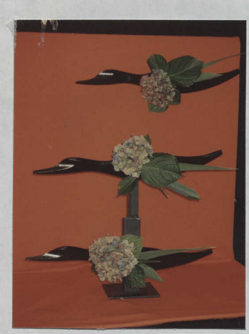
September 25, 2006 Symposium- Creative Design by Judges