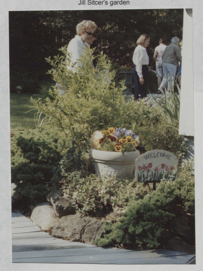
May 24, 2007- Rake & Hoe Secret Garden Tour Jill Sitcer's garden