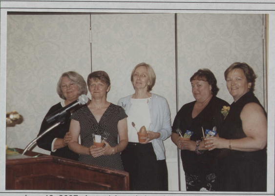
June 13, 2007- Annual Awards Luncheon at Echo Lake CC