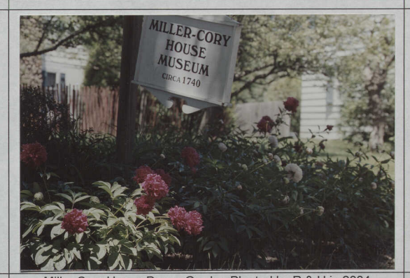
Miller Cory House Peony Garden Planted by R & H in 2004