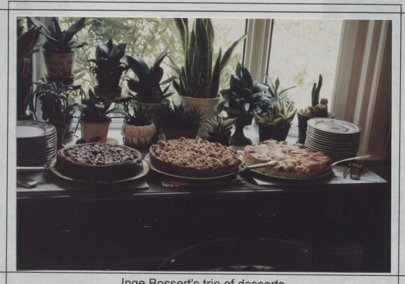
Inge Bossert's trio of desserts